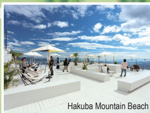
Hakuba Mountain Beach